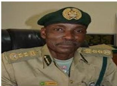
Comptroller General of NPS - Ja'afaru Ahmed

As of July - August 2018, "A total of 936 case files and 881 biometrics of inmates have been uploaded out of which 55 inmates were released". This was disclosed at the data input workshop organised by NULAI to test the effectiveness of the National Prison Information Management System (NPIMS). The NPIMS was officially launched in January 2019 by the NPS, and recent research shows that data changes on a daily basis and as of when this present enquiry was made, there were 793 open cases with 634 awaiting trial.