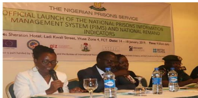
Officials at the launching of the NPIMS

Prior to this, NULAI had facilitated a round table meeting with PWAN, ROLAT and the Records and Welfare Staff of the Nigerian Prison Service in July 2018 to help support the implementation of a new case management system (CMS) known as "The National Prison Information Management System" (NPIMS). The meeting also intended to get a status update on the CMS, discuss coordination, and scheduling of data entry workshops that the NPS staff will use to enter into the CMS backlogged detainee and inmate data. The workshops and meetings were held over a 6-month period, between August 2018 and January 2019, and aimed to ensure that approximately 800-1,000 files would be entered into the CMS. Priority was given to new prisoners and prisoners who were not in the CMS.