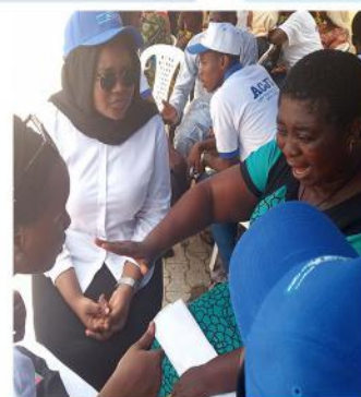
Law clinicians attending to the participants at the awareness

The project commenced on the 1st of July 2018 and is set to run through 2020.