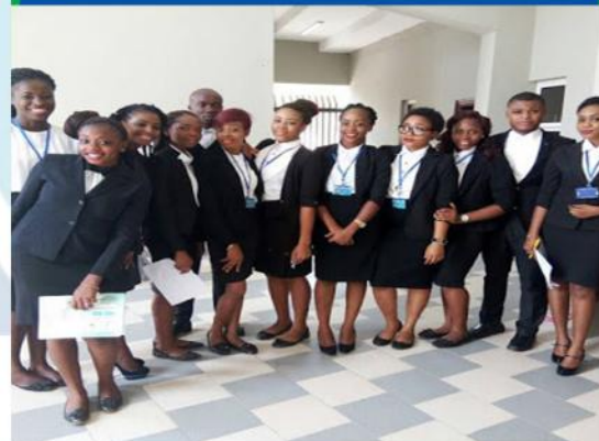
Cross section of the law clinicians.

"The pre-trial detainee programme was really worthwhile for me. I had the opportunity of interacting with different categories of people that I never thought I would interact with...."