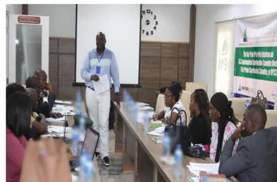
Cross section of members at the KPCC meeting.