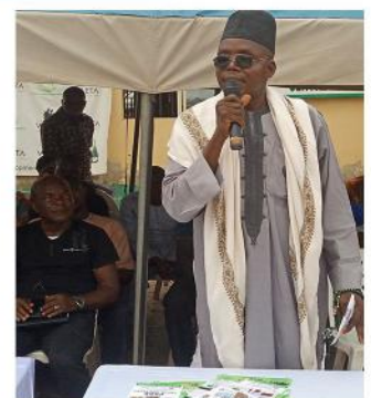
A community leader addressing the participants

partnering with NULAI are working with lawyers and law clinic students to provide pro-bono legal services to detainees who cannot afford the services of a lawyer, thereby decongesting the prison.