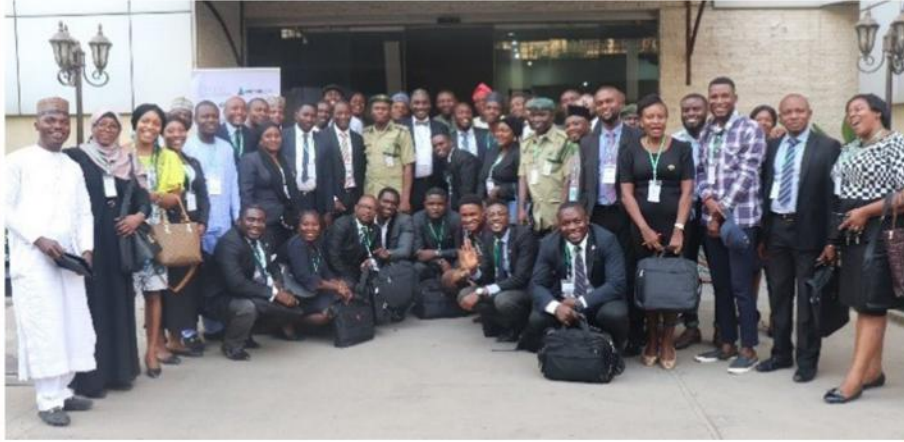
Cross-section of Lawyers and Law Students after the training